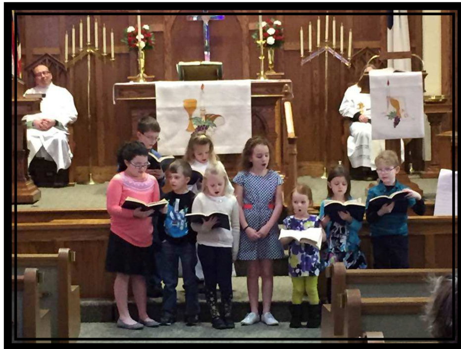
Youth Choir sang on Sunday February 26.