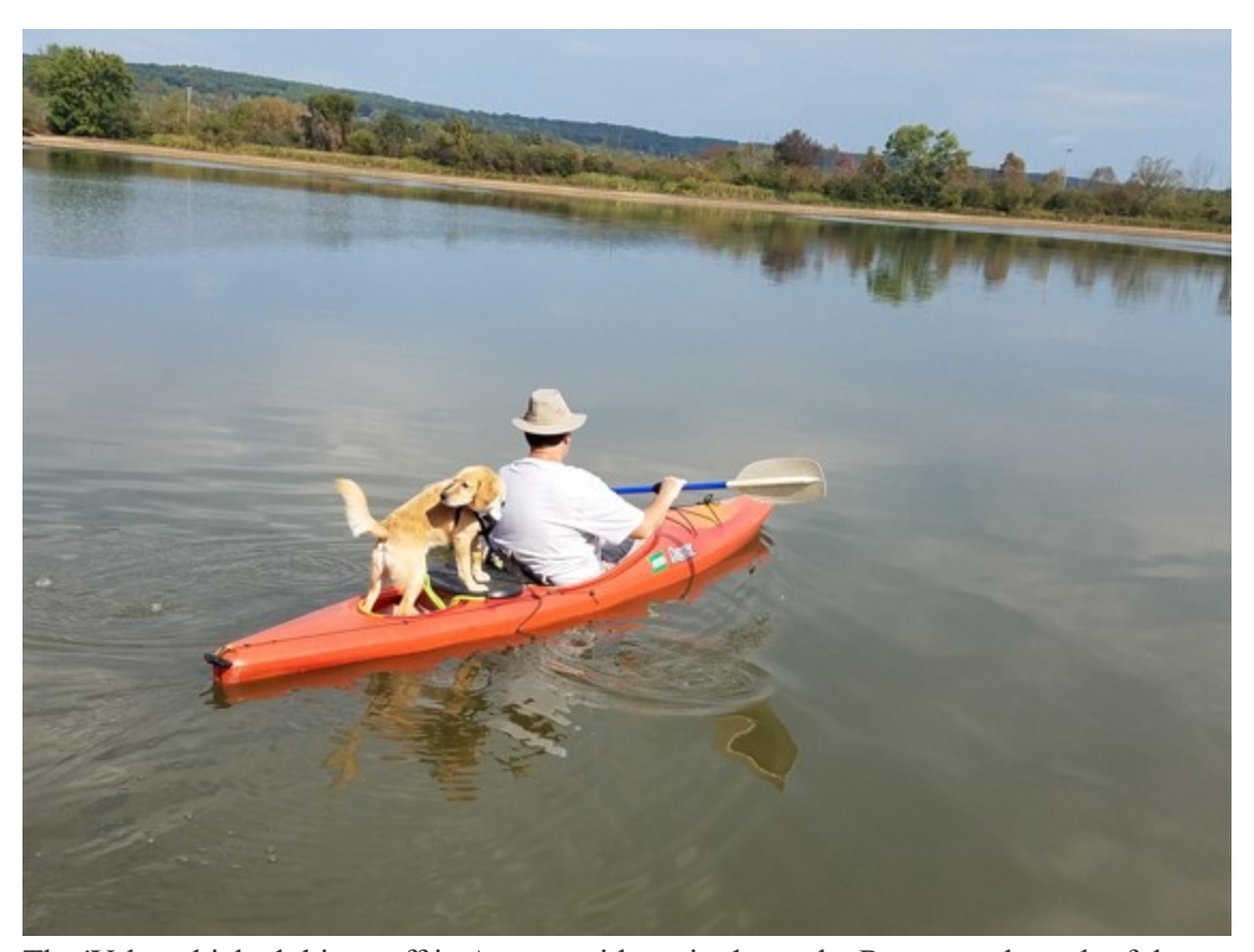
The 'Yakers kicked things off in August with a trip down the Raystown branch of the Juniata River. This time the group checked out the lake at Shawnee State Park near Bedford.