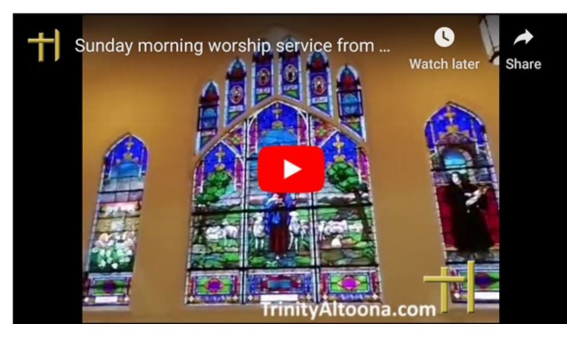
Watch Trinity Altoona's livestream worship service, recorded Sunday March 22, 2020

Can't Make It To Church? Please Give Online (Endorsed by the ELCA)