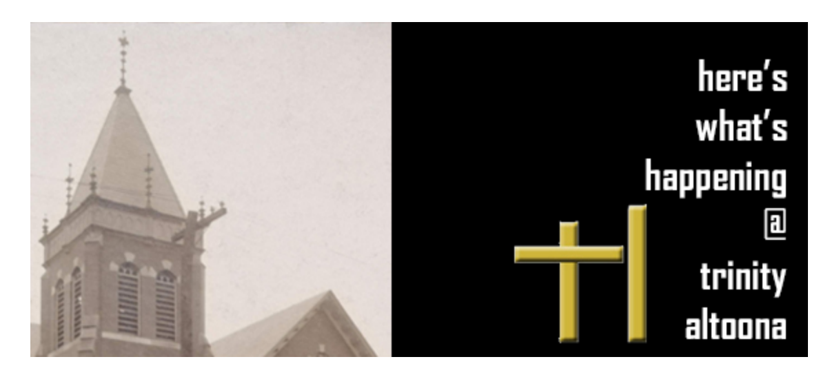
Note: events and activities are subject to change. Please stay tuned to our website and Facebook page for the latest updates

Pastor Hess and your church council will continue to stay on top of the situation and, as conditions change, we will strive to make the best decisions for our entire Trinity family. May God bless us all and keep our families and friends safe and healthy through the challenging days ahead.