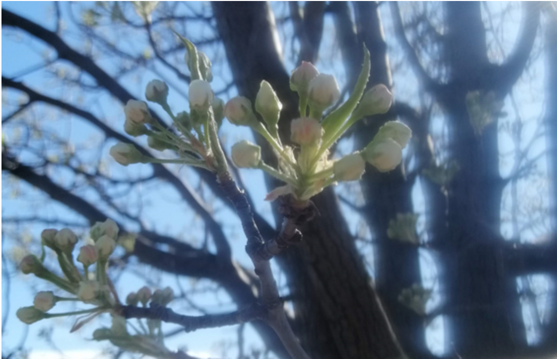
Taken Thursday April 2 by Martin's on Chestnut Avenue.